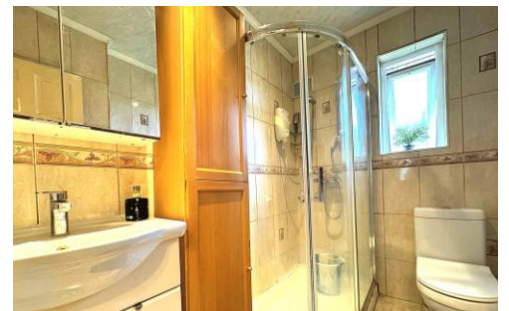
Sudbury Croft , Wembley, , HA0 2QW