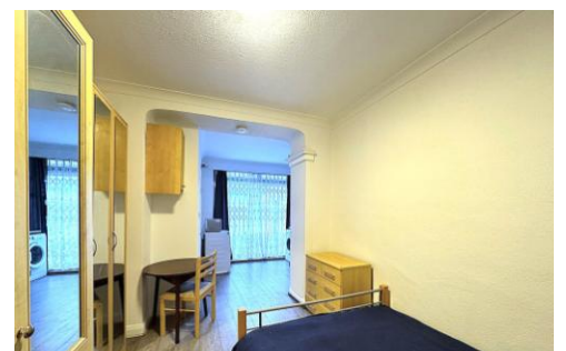
The Grange , Wembley, , HA0 1SY