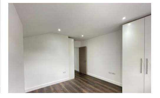
Harley Road , London, , NW10 8AX