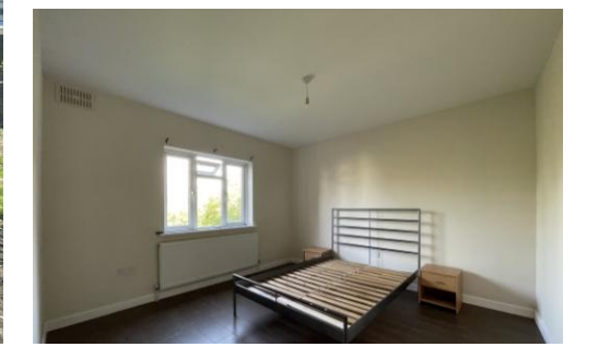
Raglan Court Empire Way, Wembley, , HA9 0RG