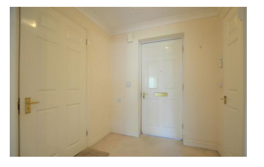
Bishops Court Watford Road, Wembley, , HA0 3FE