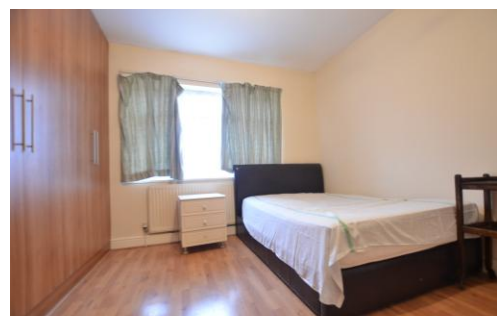
EPC Available on request